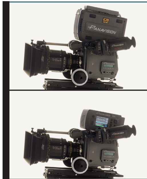
Genesis with on-board SRW-1 (top) and SSR-1