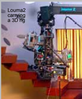
Louma2 carrying a 3D rig